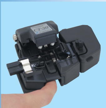
1. Blade setting