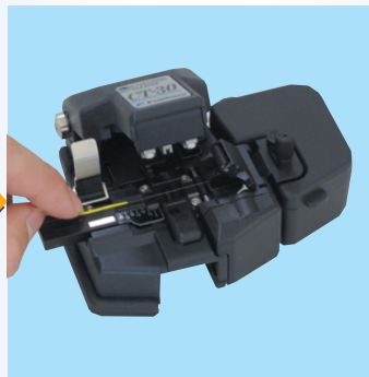
2. Fiber placing